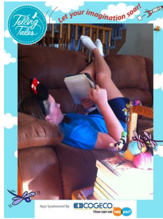
3 rd place photo