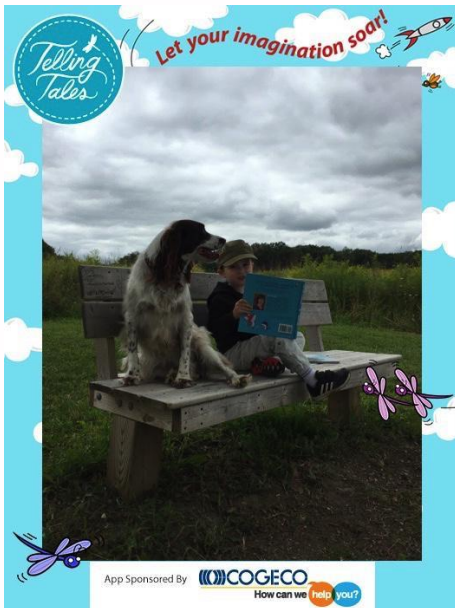
1 st place photo

There are so many wonderful reading spots, whether it’s with a friend, on the porch, or just before bed. Participants simply had to show us their favourite place to read using the Framelt! feature on the Telling Tales App, which is generously sponsored by Cogeco. Enjoy these book nooks from our contest winners: