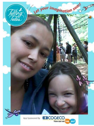
4 th place photo